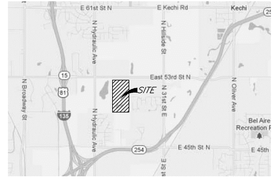
LOCATION MAP (For Visual Use Only)

1/2" Iron Pipe (found) NE Corner NW 1/4 Sec. 22, T26S, R1E